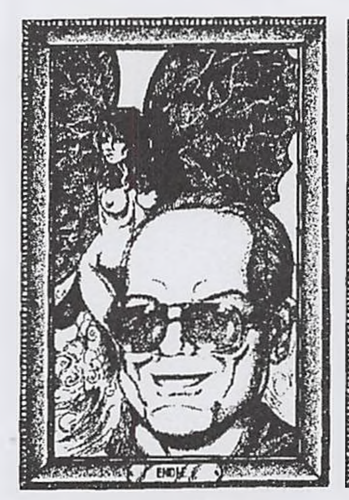
Endle, possessed by his butterfly lover, spawns a love that eats him up inside...