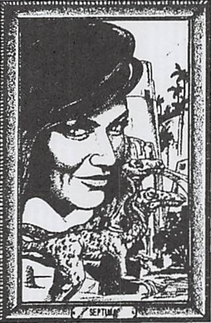
Septima, obsessed with the Parallux Windows, falls victim to their power as she traverses the multi-dimensional planes...