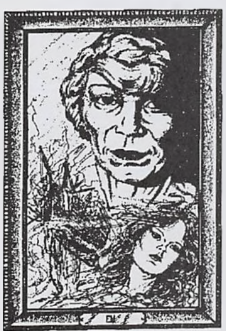
Em, possessed by the soul of a young suicide, fulfills the soul's final tryst with her drowned lover...