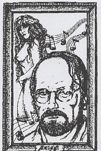
Senechelle, haunted by his creative failure, awakens the nymph asleep in the wood of his piano...