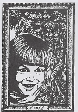
Eryc, young and innocent, discovers the secrets of trees—their songs and dreams and visions...

Wetrd Family Tales I & II (In one volume) Now Available— Hard cover (printed on acid free paper): $19.95