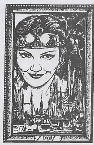
Envya, irrevocably insane, projects her bizarre inner world into reality and threatens the fabric of the universe...