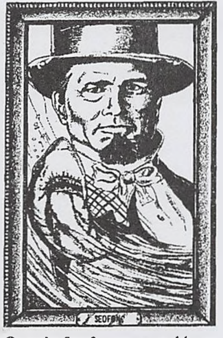
Captain Seofon, pursued by a supernatural shark, takes the battle into the present to the horror of his descendants...