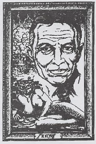
Seweyne, forced to decide between world peace and love of family, chooses to his eternal damnation...