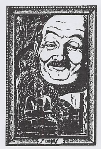
Endrik, seeker of conjuror's tricks, finds Truth in a monk materialized out of his own meditations...