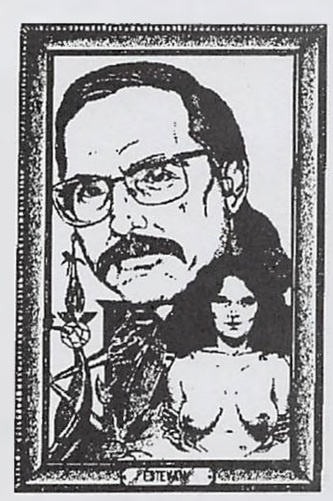
Estevan, obsessed with the paintings of Hieronymous Bosch, falls into those surreal landscapes with his beautiful lover Vini...